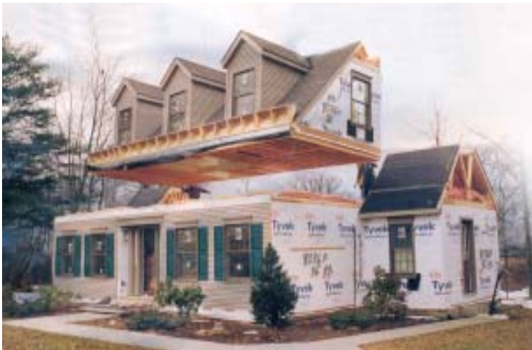
Set in one day, finished in weeks

We know this is an important choice. We guide you through every step of the process, from permits to financing and through to completion of your dream home.