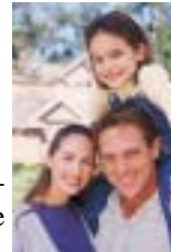
The home of your dreams

O ver 20 years of successful experience in custom home development.