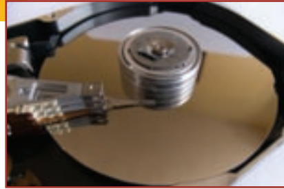
Protect Valuable Data